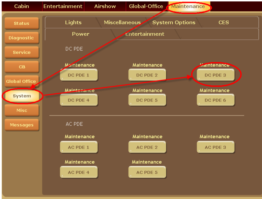
Figure 5 Access to DCPDE 3 (Global 5000)