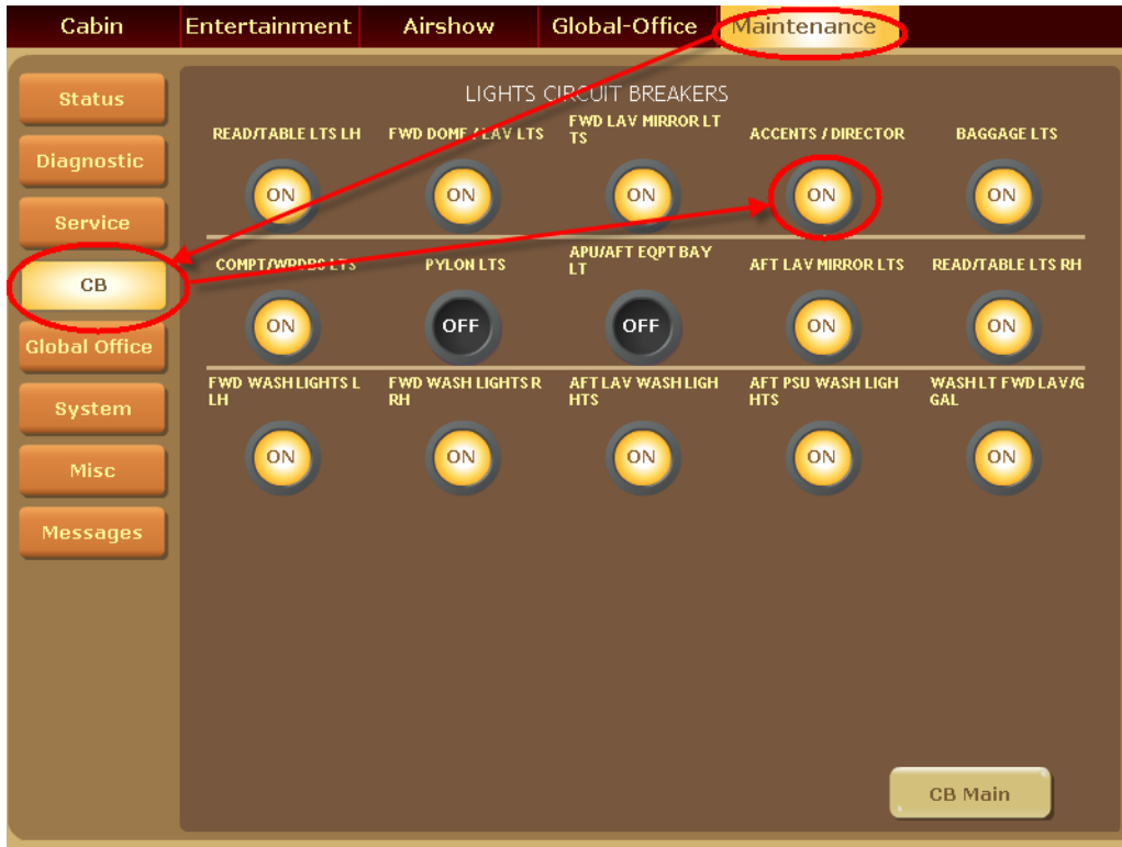
Figure 4 Access to ILSD circuit breaker (Global 5000)

Set the Circuit Breaker to OFF via the System page.