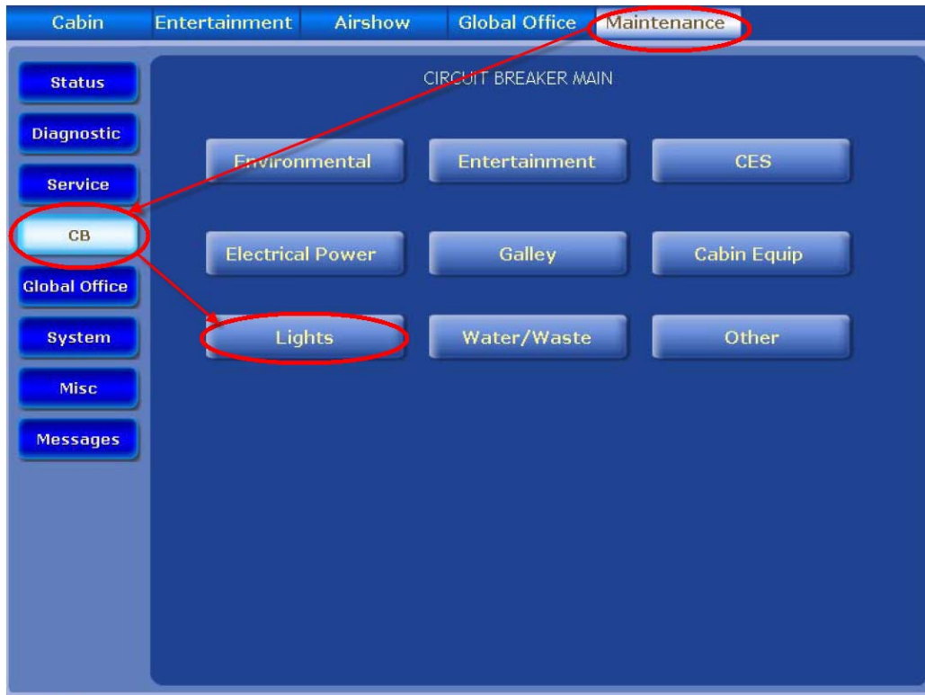
Figure 1 Access to the LIGHT tab (XRS)