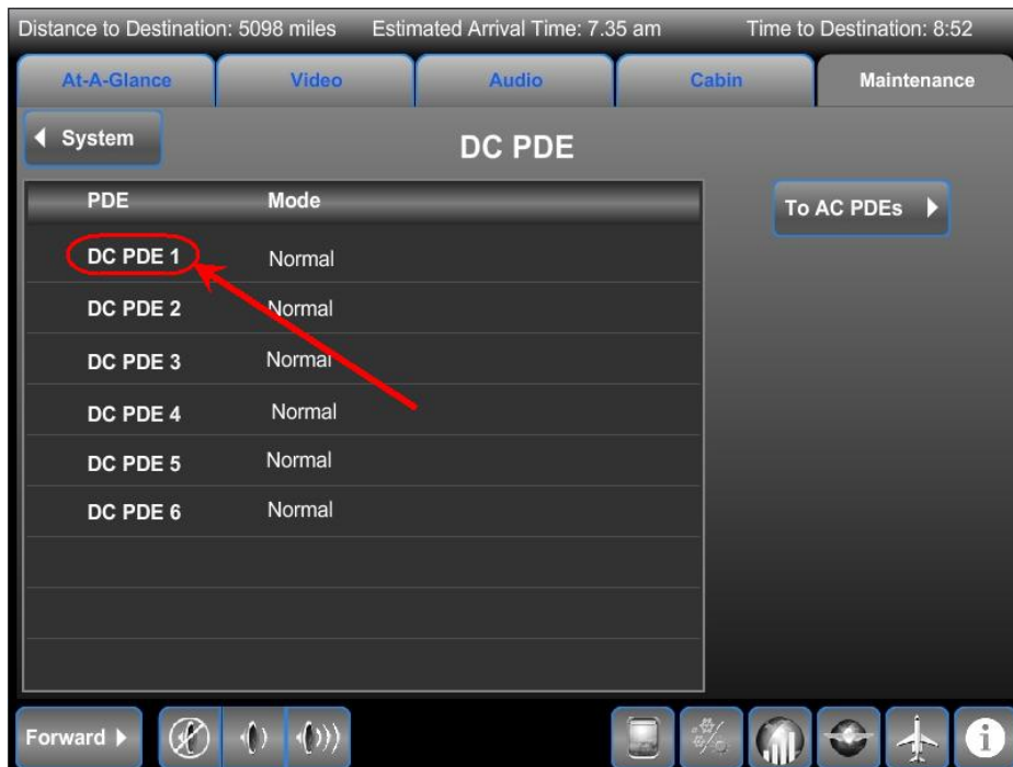
Figure 3 DC PDE page.

(g) On the Galley touchscreen, at the DC PDE 1 page Select DC PDE 1 .