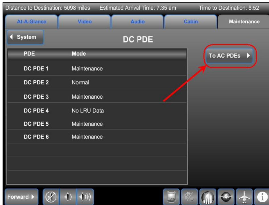
Figure 4 DC PDE page to AC PDE page.

(g) Select To AC PDEs icon on the DC PDE page.