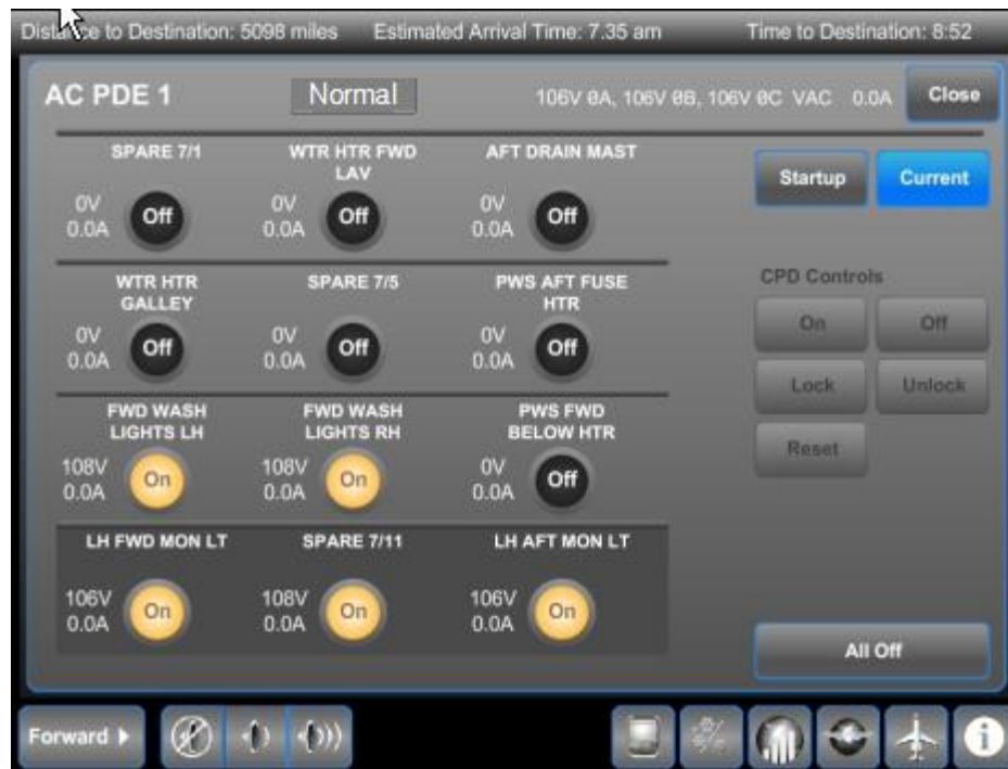
Figure 6 AC PDE 1 page.