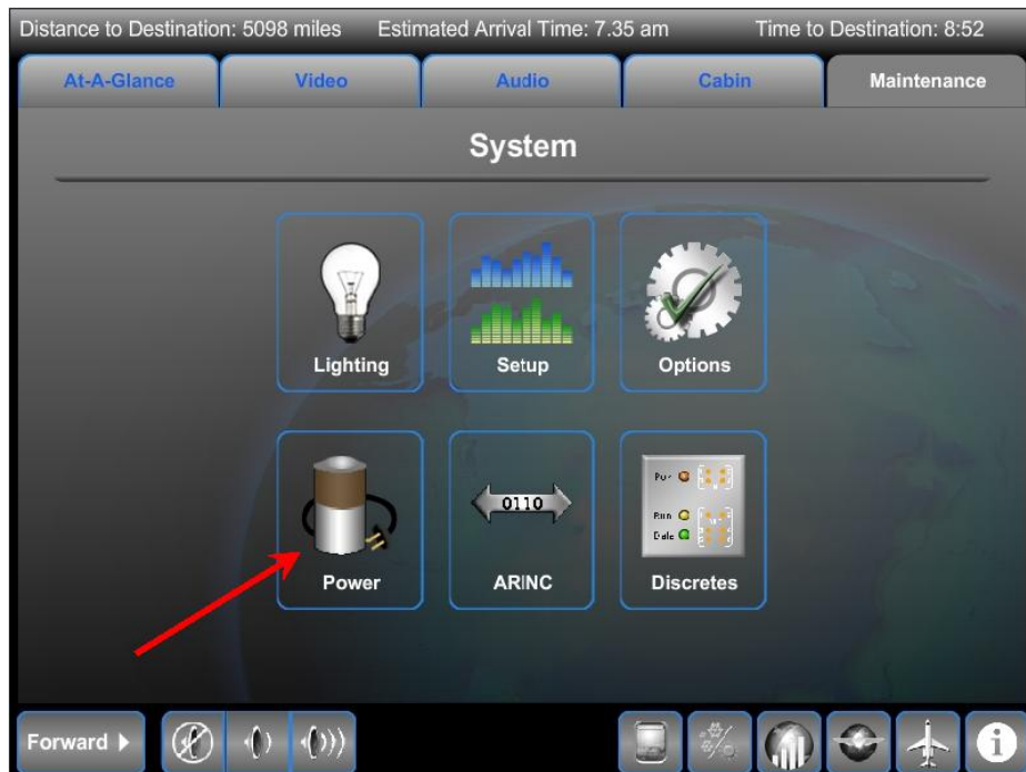
Figure 2 System page.

(g) On the Galley touchscreen, at the DC PDE 1 page Select DC PDE 1 .