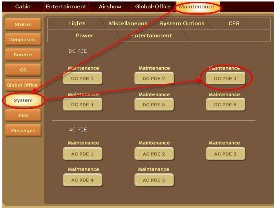
Figure 5 Access to DCPDE 3 (Global 5000)