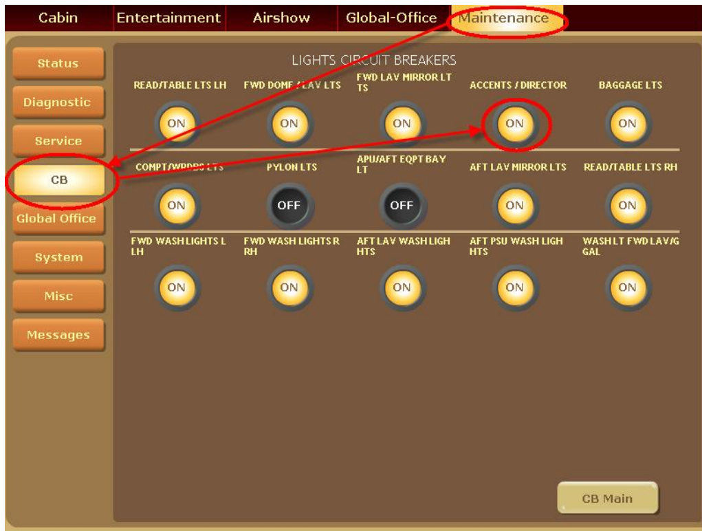
Figure 4 Access to ILSD circuit breaker (Global 5000)

Set the Circuit Breaker to OFF via the System page.