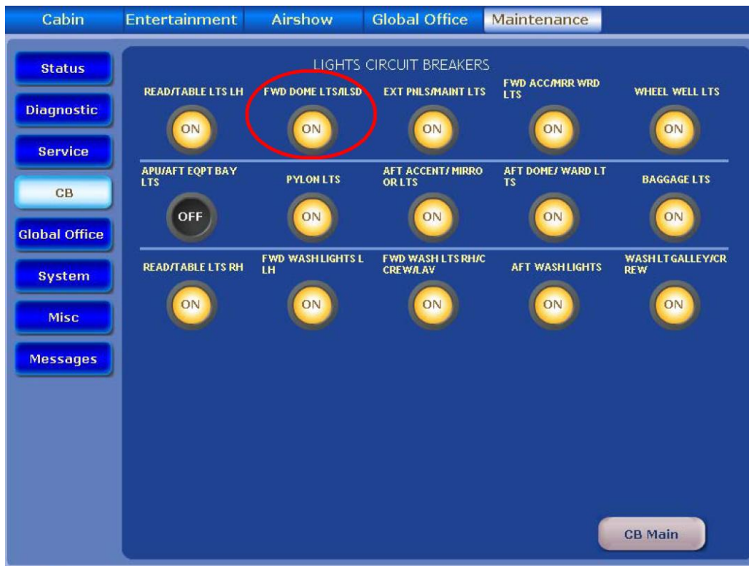
Figure 2 ILSD circuit breaker (XRS)

d. Select the FWD DOME LTS / ILSD circuit breaker to turn it OFF.